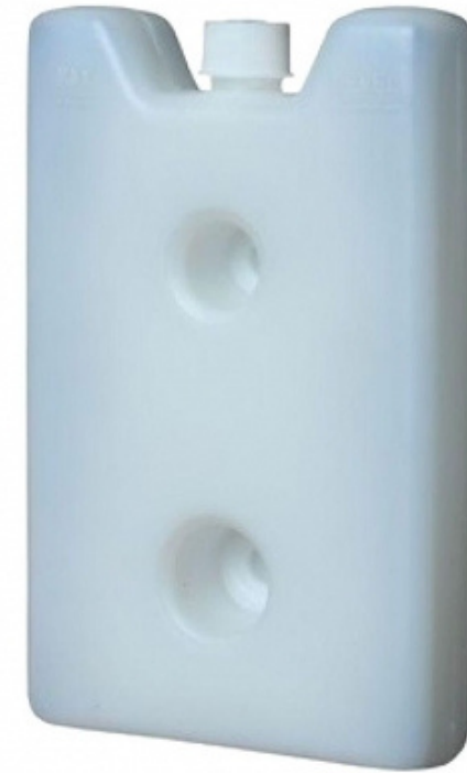
Product Code: VCS20110001 - (Ice Packs)