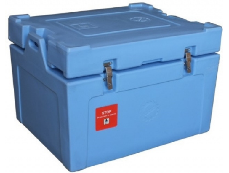
Product Code: VCS20100001 - (Vaccine Carrier)