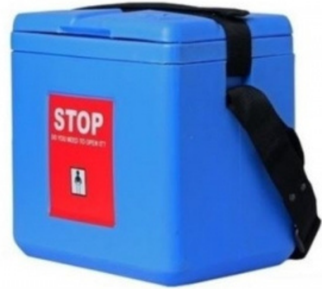
Product Code: VCS20100002 - (Small Vaccine Carrier, Short Range)